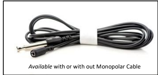
Available with or with out Monopolar Cable