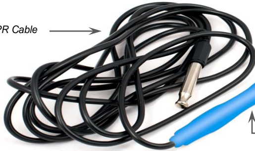
Light weight Ergonomic Molded Handle for safe & easy operations

Available with monopolar cable, High Quality Insulation Tubing all the way to the electrode. Ensuring insulation down to the blades (Dielectric Strength - 20 Kv/mm) provides greater patient safety